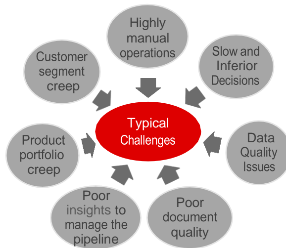
Figure 1: Typical challenges faced by the Mortgage Industry

Despite the advances in AI and ML industry, less than 30% of the lenders are leveraging AI. Origination of loans is still cumbersome and frustrating. Over 90% of Origination is still "Non-Intelligent" and follows the concept of "One size fits all". AI can be leveraged to address the following challenges in Mortgage Origination: